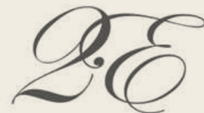
2nd EDITION Interior Consultant

Park + Associates is a craft-driven architectural studio with a diverse portfolio spanning residential, hospitality, commercial, and master planning projects. Renowned for its expertise in residential design, the firm creates site-responsive, detail-oriented spaces that reflect artistry and purpose, enriching everyday living through thoughtful architecture.