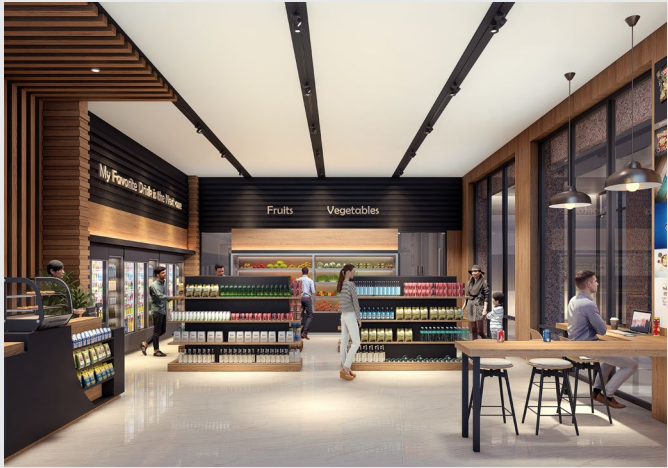
Modern supermarket provides fresh produce and groceries.