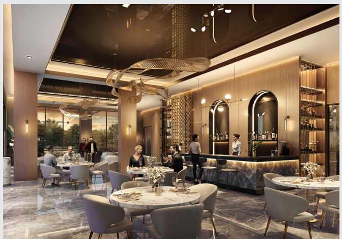
Fine dining restaurant for high–end neighborhood.