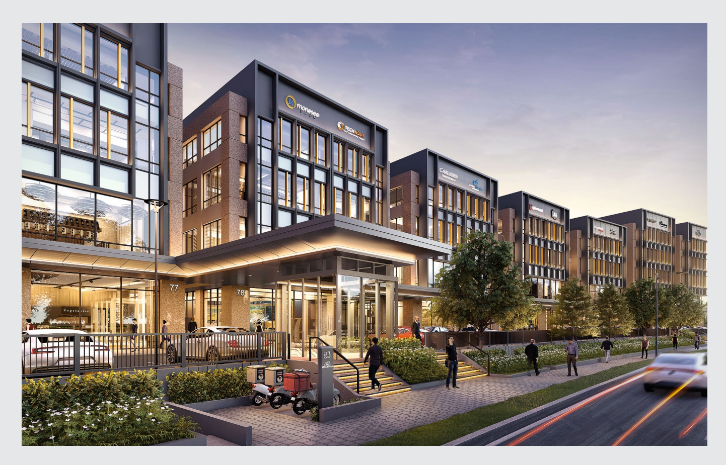
Located in the busy area at the grand boulevard of BSD City, North Point TWO aims to create an inspiring and stylish space for unlimited business opportunities.