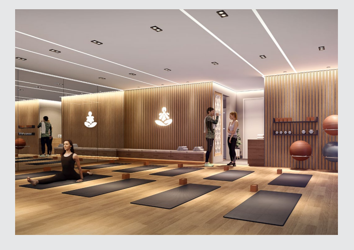
Relax and unwind at a state-of-the-art yoga studio.