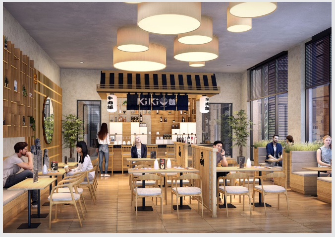
Meet up and chat with friends at a stylish cafe.