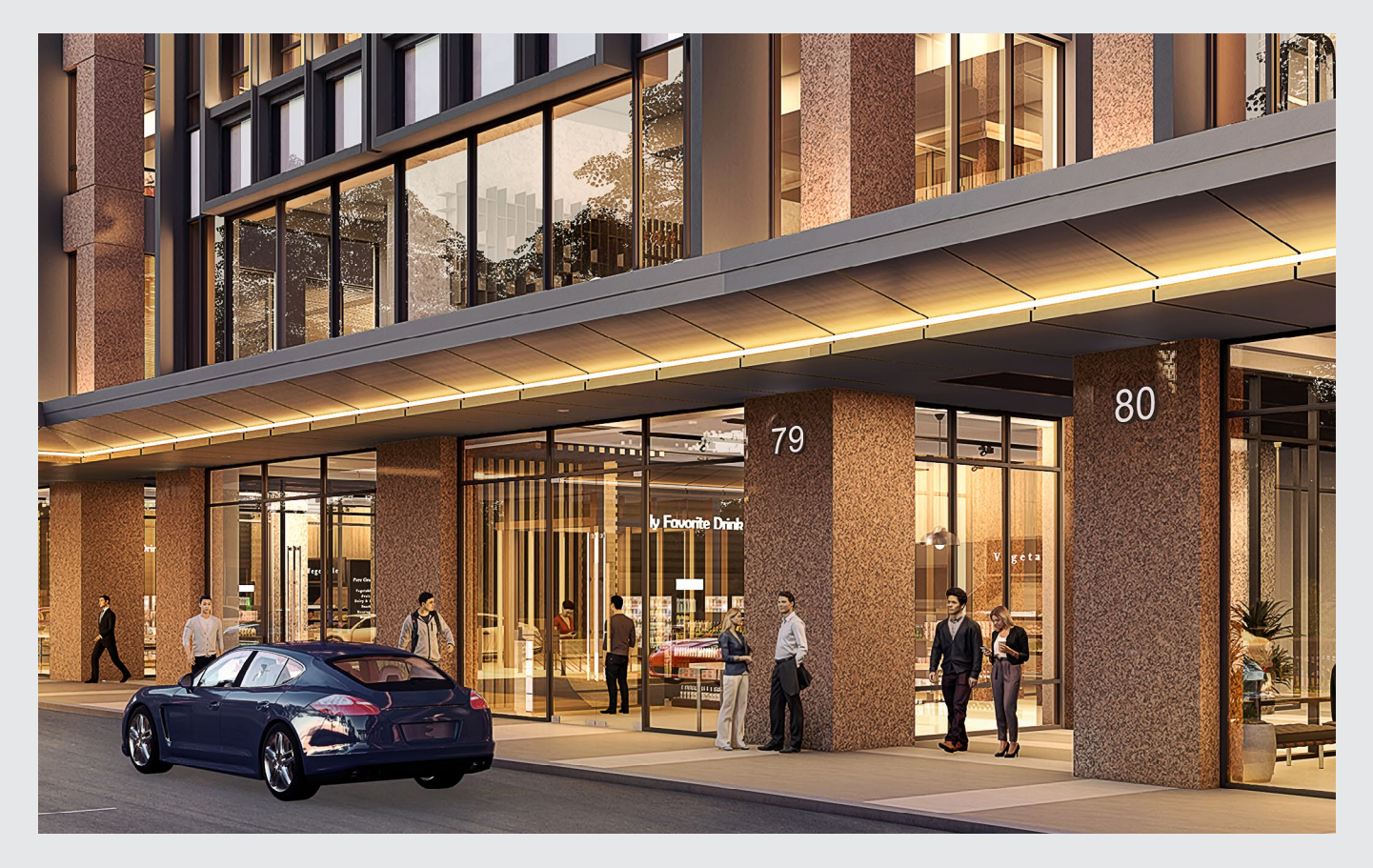
North Point TWO is inspired by the high street in London, New York and Paris, an area where important business, retails and stores are located.