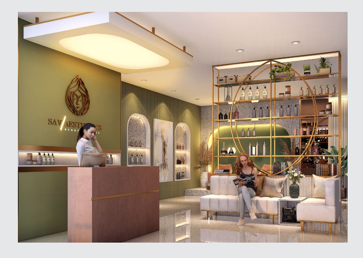
Fashionable beauty salon caters to every style needs.